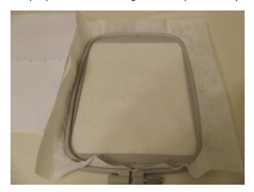
Hoop 1 piece of medium weight tear away or cut away stabilizer.

Use the little marks on the hoop to get the fabric with the template taped to it as straight and even in the hoop as possible. Secure the fabric to the hooped stabilizer with some spray adhesive and some straight pins. It is important to secure the fabric well to minimize any slipping so that your next two templates will line up.